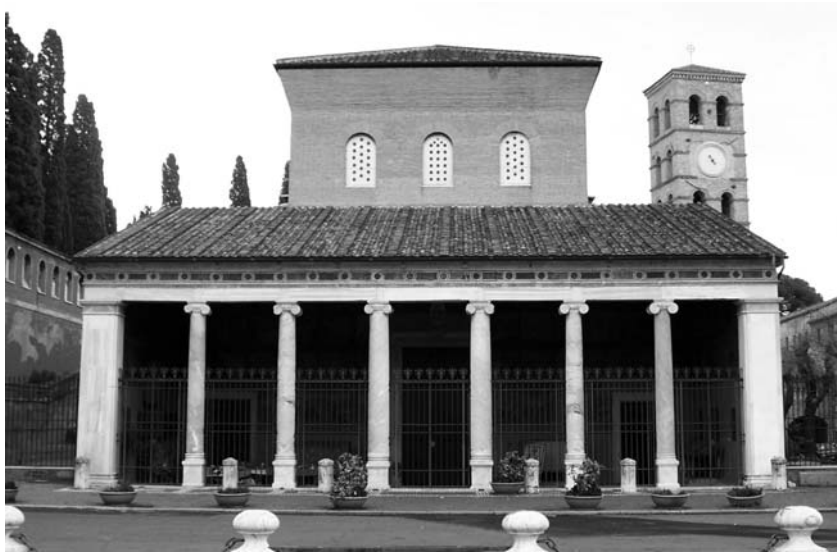
St. Lawrence Church today

Pray to God for me, O Saint Lawrence, well-pleasing to God, for I readily recommend myself to you, who are the speedy helper and intercessor for my soul. Amen.