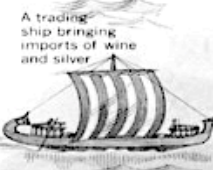
A trading ship bringing imports of wine and silver