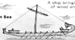
A ship bringing imports of wood and tin